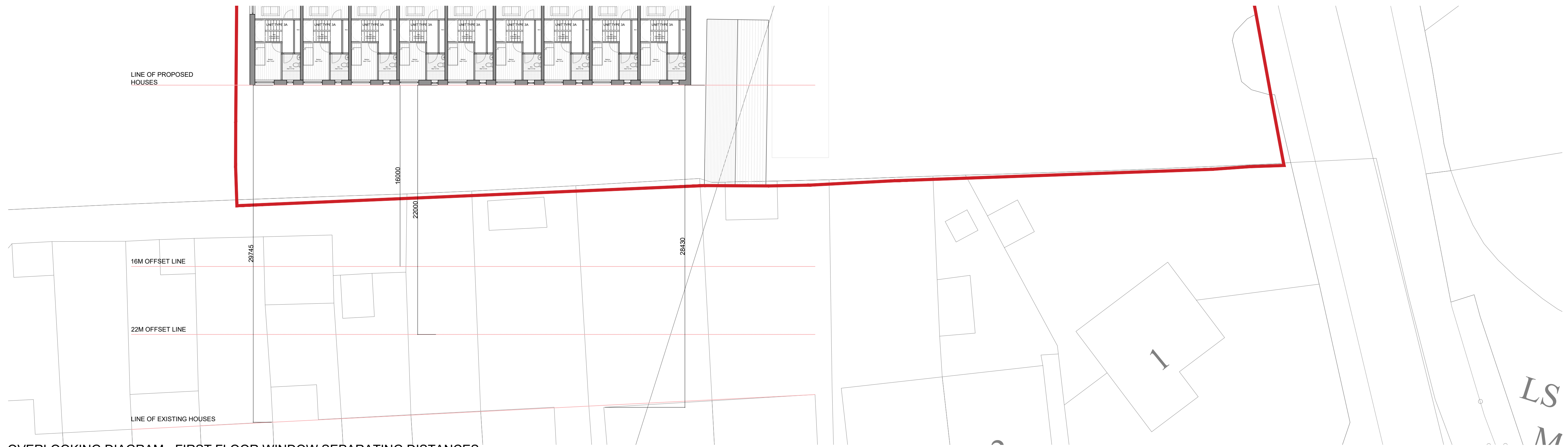
OVERLOOKING DIAGRAM - FIRST FLOOR WINDOW SEPARATING DISTANCES